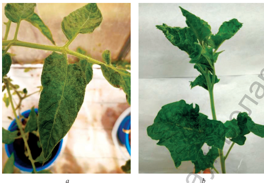
Figure 4. Symptom development of Pepino mosaic virus in Lycopersicon esculentum cv Lyana (a) and Physalis pruinosa cv Yantar' (b)

PepMV is mainly accumulated in D. stramonium L. and N. rustica L. plants, where the content of viral particles 4 weeks after infection reached 1.013 and 0.952 units OD (optical density), after 20 weeks – over 2.400 OD. In plants L. esculentum Mill. and C. annuum L. high virus concentration only 20 weeks after inoculation was observed (Figure 5).