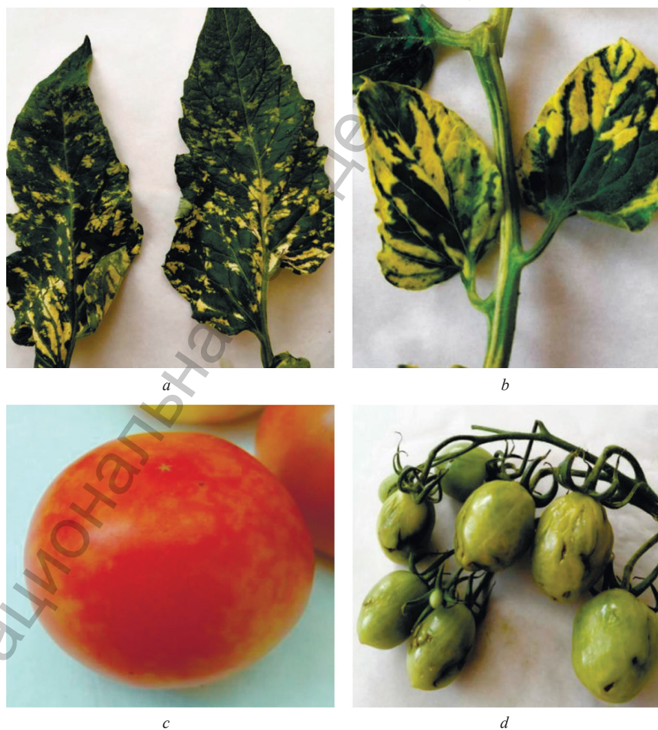
Figure 1. Symptoms Pepino mosaic virus on tomato plants: a – yellow mosaic on the leaves; b – yellow leaf spot and streakiness on the shoots; c, d – spotting and deformation of fruits

The possibility of PepMV development in tomato plants together with other viral pathogens is noted in the works of many authors. Thus, PepMV was detected with CMV, Tomato chlorosis virus (TCV),