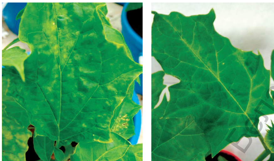
Figure 3. Reaction of Datura stramonium L. to infection with Pepino mosaic virus (laboratory experiment, 2019)

It is known that the reaction of plants of the genus Nicotiana to infection with PepMV is variable and strongly depends on the strain composition of the pathogen, the type and even the variety of tobacco. For example, the reaction to mechanical inoculation with the polish isolate of N. tabacum cv White Burley plants manifested itself as vein chlorosis and mosaic. N. tabacum cv Xanthi reacted in the same way [23].